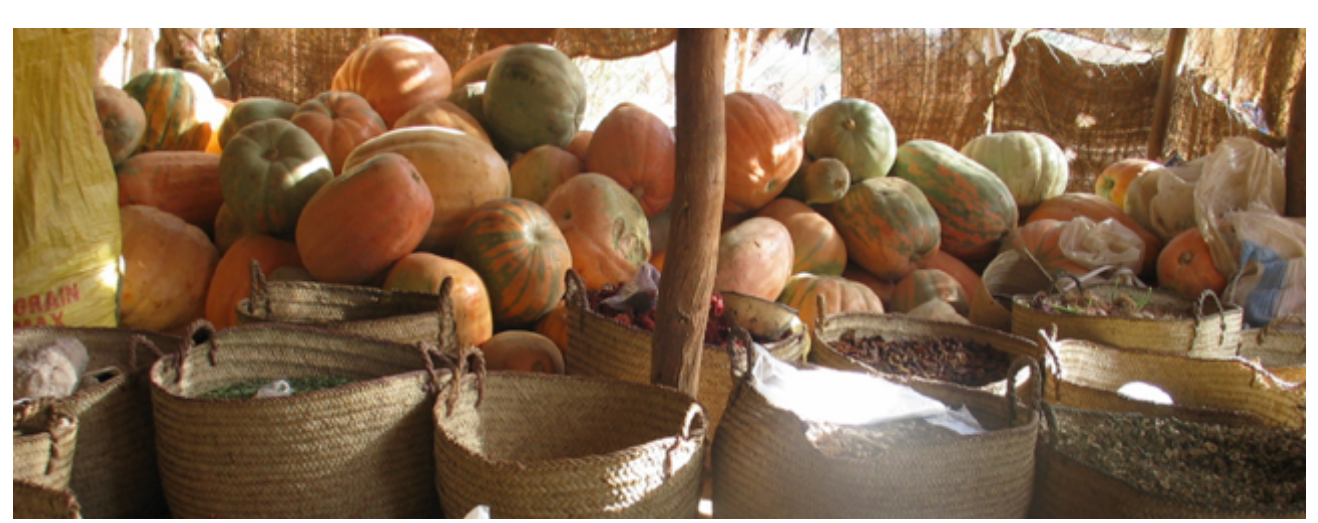
Smallholder farming supplies dynamic local markets, Burkina Faso.

The rebranding of the EBA cannot hide a fundamentally top-down approach and a flawed process. After data collection in ten pilot countries and the release of the indicator's first progress report, the Bank announced plans to expand the project to 30 additional countries in 2015.<sup>43</sup>